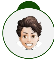
Donald Finance donaldo@tfgwa.com